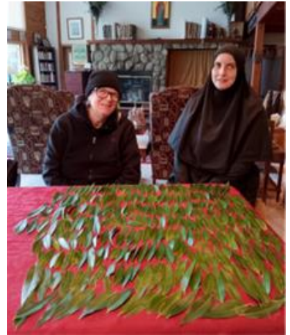
Above: Cleaning bay leaves, one leaf at a time.

In recent years, there has been a surge in requests for our bay leaves. Unbeknownst to many: harvesting, cleaning and processing each pound of leaves (about 1000 leaves/lb!) requires a great many nun-hours. As such, in order to continue to provide bay leaves and also meet our increased Lenten obligations, we ask for your understanding and help: