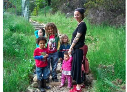
It's all in a day's work!

The monastery workday on April 9 th turned out differently than any other we have ever had. Along with their moms and dads, a host of children came to participate. No one has ever seen such diligent and enthusiastic weeding of the monastery paths! And the gravel gazebo floor that looked rather like