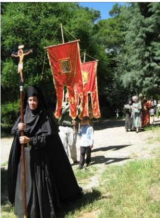
The procession to the new chapel site.