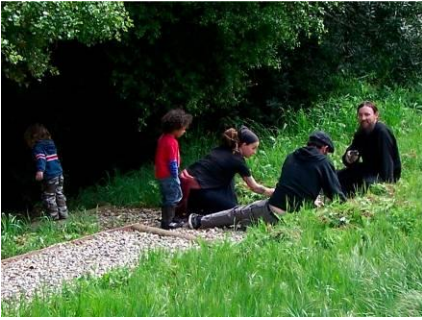
Finishing the weeding of the stairway.

a meadow in itself, was clear of every blade of grass in no time at all. The photos tell the story better than it can be written. We thank their moms and dads for bringing these unsurpassed workers.