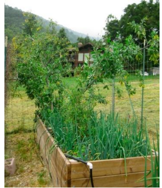
Our evangelical mustard tree

At about this time a couple of years ago, just as we were about to plant our vegetable garden, a small, important-looking volunteer seedling appeared in the space that was planned for a lettuce bed. It looked to us like it might just be an infant cauliflower or maybe broccoli. We decided to let it grow undisturbed and see what it might turn out to be. Grow it did, taller and taller, thicker and thicker. More than a year passed, and we still had not identified it. It blossomed with pretty—but not spectacular—little yellow flowers, and we waited to see what fruit might form. None did. Some people said: “It’s a weed. Chop it down.” An agricultural student came by and said: “It’s a weed. Get rid of it.” But we just couldn’t. The yellow flowers on the lowest branches wilted and fell off, leaving behind unremarkable brown pods filled with what looked like brown dust, as more little yellow flowers appeared on the branches above. The plant grew higher—higher than the deer fencing surrounding our vegetable beds. And the two “stems” grew larger (maybe three inches in diameter), so that they almost qualified to be called ‘trunks.’ A hawk started to spend long hours on a branch near the top, using it as a post to survey the meadow for prey. It was Seraphima Butler (our catechist friend—who else would know!) who with great excitement finally identified our mysterious volunteer. It is the mustard of Jesus’ parable in the Gospel of Matthew: