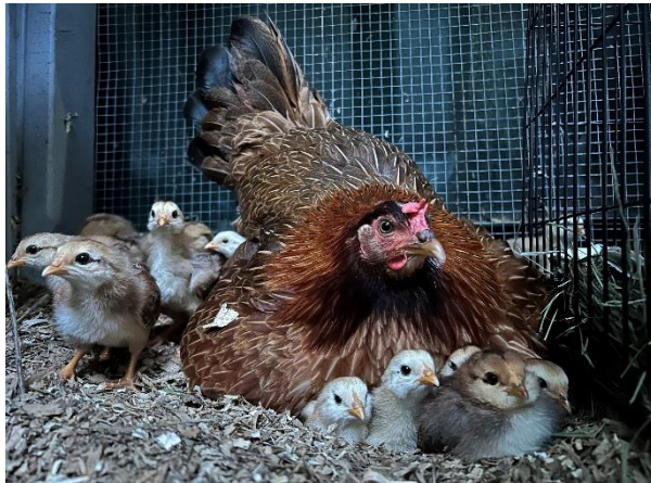
Top Left: Ventura Greek Festival booth Top Right: Happy little customer Left: Mama hen raising 18 peepers Bottom Left: Teens listen attentively Bottom Right: Let the little children come!