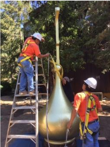
Harnessing the dome

The domes are understood to represent the flames of fire which came down from Heaven and anointed the apostles in the upper room where they were waiting on the day of Pentecost. It seems fitting that our domes were placed atop the chapel just in time for the Feast!