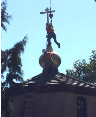
Lowering it into place