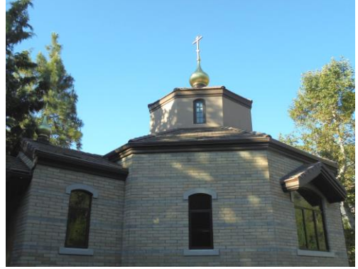
Chapel with the domes in place at last!