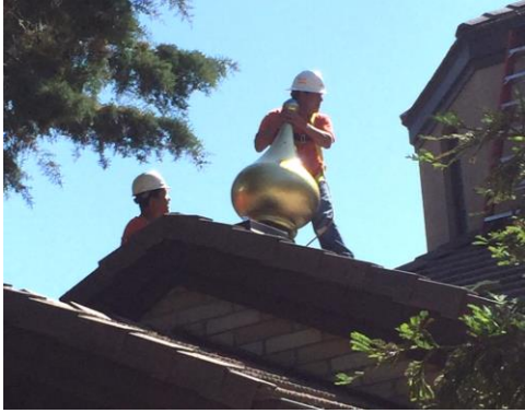
This one's easy!